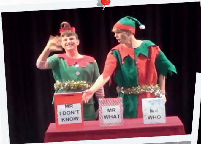
Field Close and Fallowfield